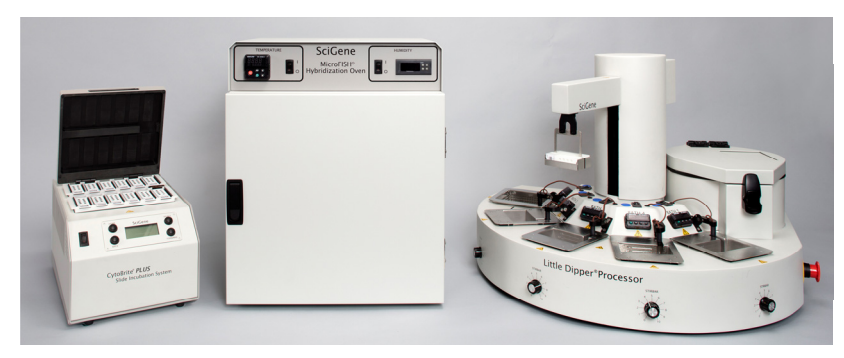
CytoBrite® PLUS System with MicroFISH® Hybridization Oven and Little Dipper® Processor