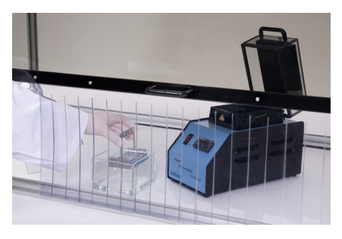
The NoZone WS Workspace features a flexible curtain to allow for manual processing of up to 16 arrays with the Hybex<sup>®</sup> Microarray Incubation System.